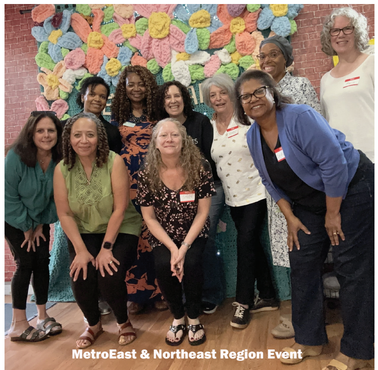
MetroEast & Northeast Region Event