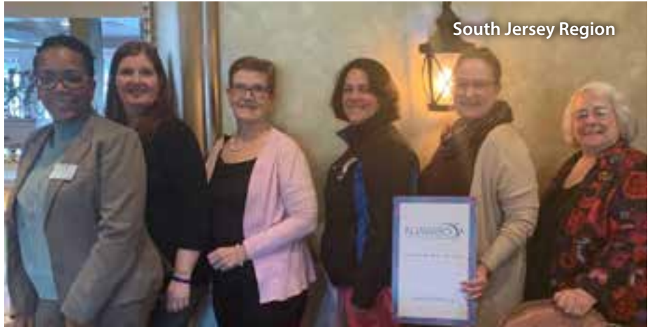
South Jersey Region